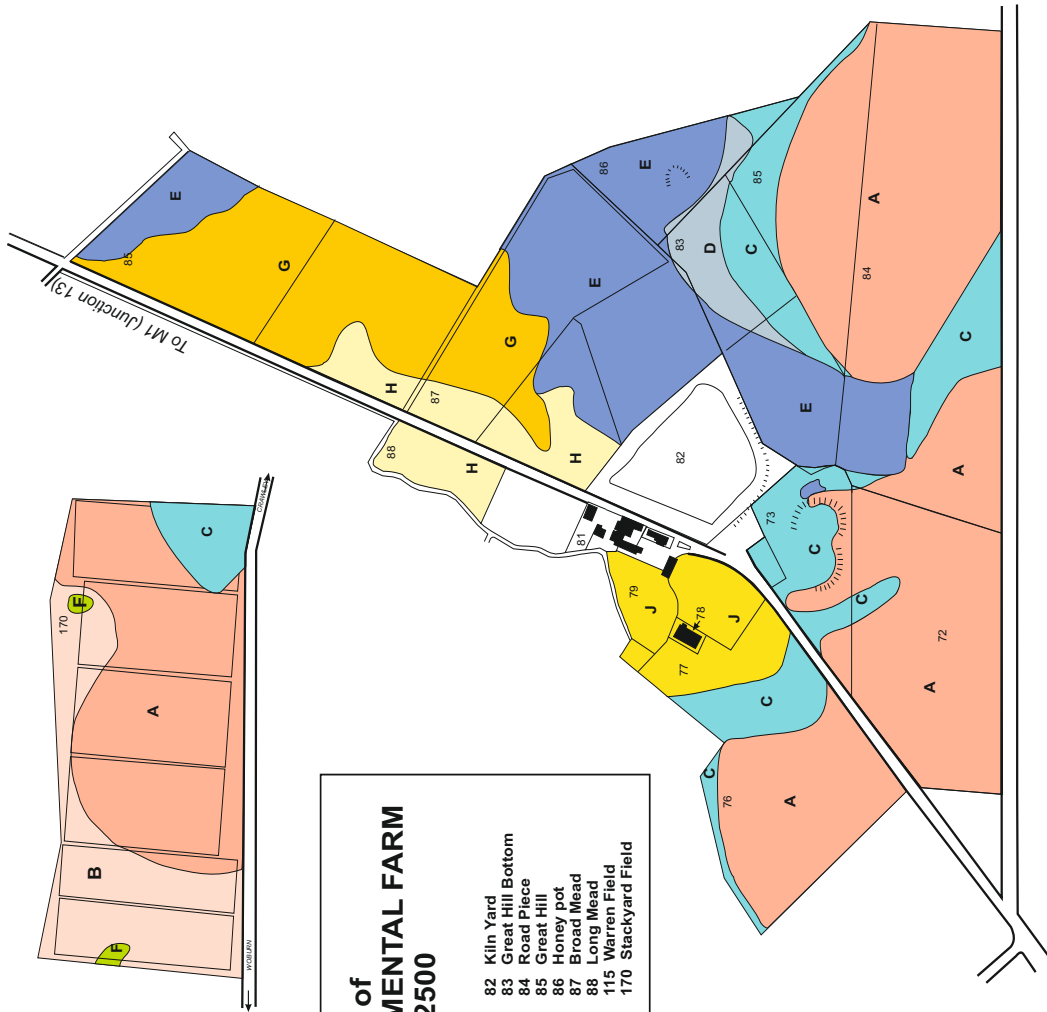
A Plan of WOBURN EXPERIMENTAL FARM Scale 1:2500 72 Butt Close 82 Klin Yard 73 Butt Furlong 83 Great Hill Bottom 76 Lansome Piece 84 Road Piece 77 Mill Dam Close 85 Great Hill 78 Pot Culture Station 86 Honey pot 79 Orchard & Garden 87 Broad Mead 80 House & Buildings 88 Long Mead 81 Stackyard / Feeding Boxes 115 Warren Field 170 Stackyard Field