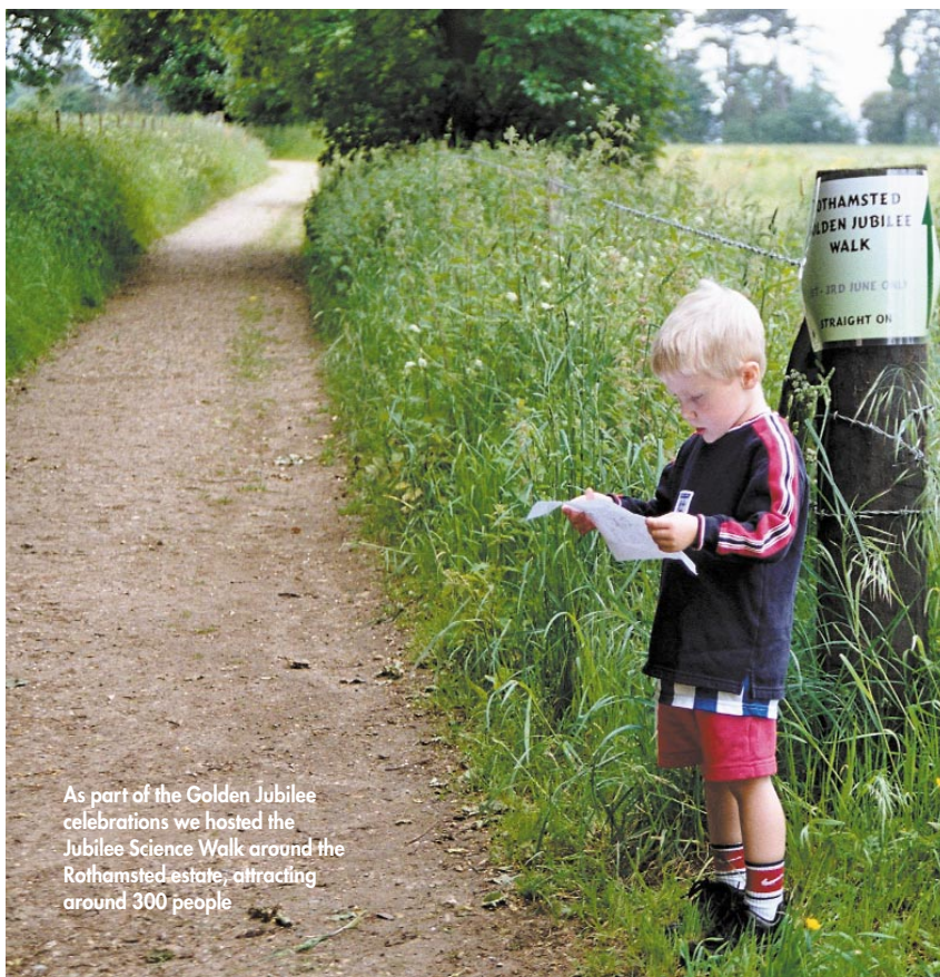
As part of the Golden Jubilee celebrations we hosted the Jubilee Science Walk around the Rothamsted estate, attracting around 300 people

need for new, substitute technologies founded on sound science, that will in time replace inputs dependent on non-renewable resources.