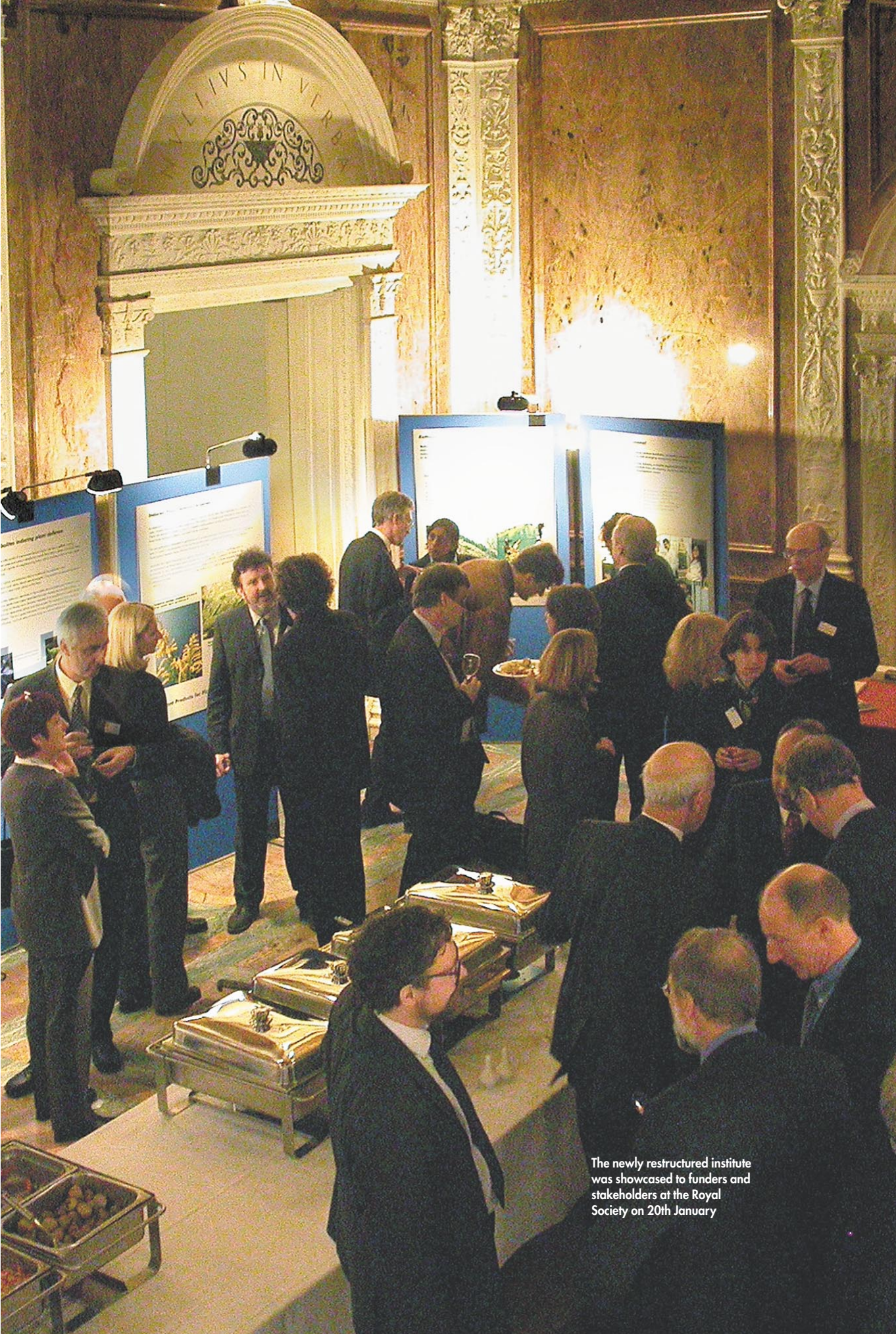
The newly restructured institute was showcased to funders and stakeholders at the Royal Society on 20th January