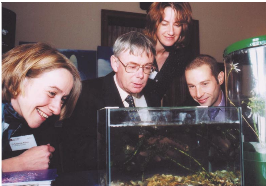
'Chasing the High Flyers' exhibit on vertical radar studies was selected for the Royal Society summer science exhibition. It was also featured at the Tomorrow's World Roadshow and the Science museum